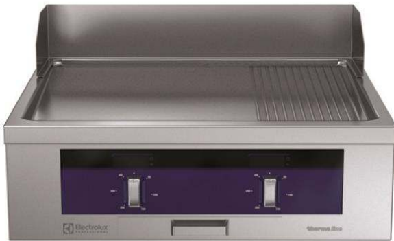
589107 (MCHOABH0AO) Electric Fry Top with smooth and ribbed chrome Plate, one-side operated with backsplash